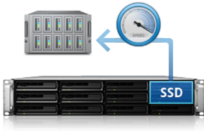
Figure 1) SSD Cache

Synology SSD cache technology boosts throughput efficiently while minimizing cost per gigabyte.